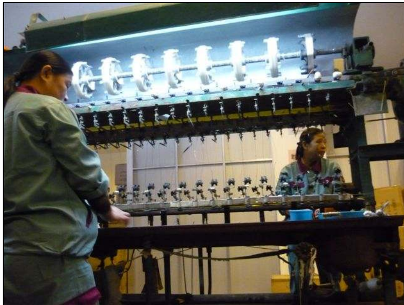
The National Silk Institute in Shanghai, where silk embroidery and other important local crafts have a thousand years of history.

We flew back to Beijing and all 55 travelers said that "the trip exceeded my expectations"!