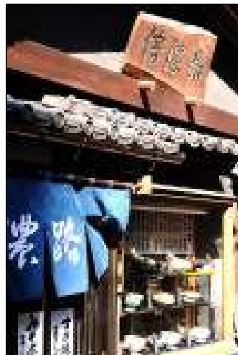
Pictures from Chiba Prefecture... a hanging monorail (left) and a typical shop.