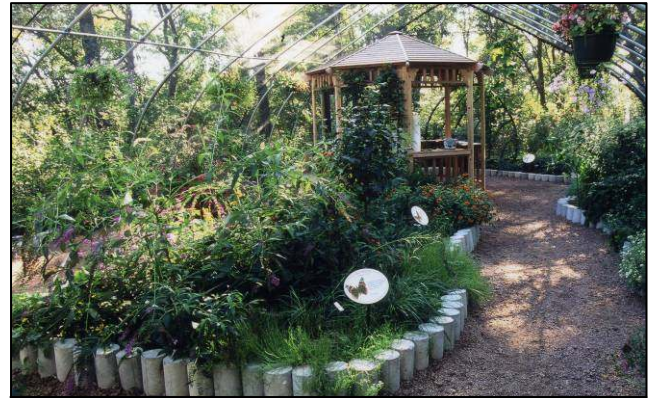
Beaver Creek Reserve Butterfly House

The Citizen Science Center began with a pilot program of field research projects by students from area schools. This research yielded valuable scientific information as well as valuable environmental experience for the students. The Citizen Science Center grew out of the need for a facility