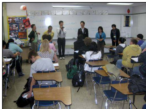
GSE Team takes part in the Japanese language class at Memorial High School