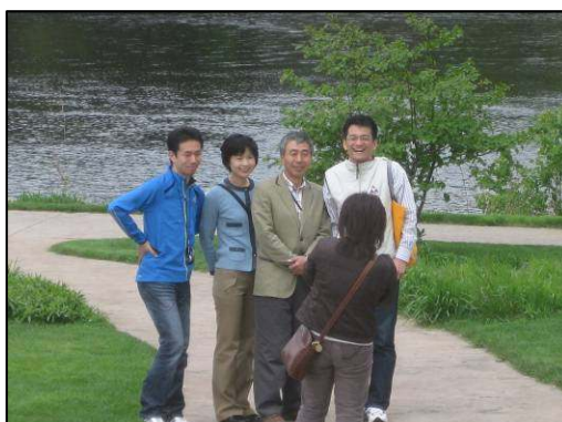
GSE Team Visits beautiful Phoenix Park