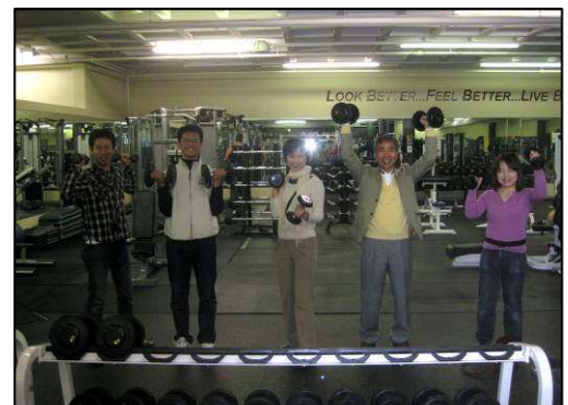
Julie Wren (not pictured) gives GSE a working tour of Highland Fitness Center