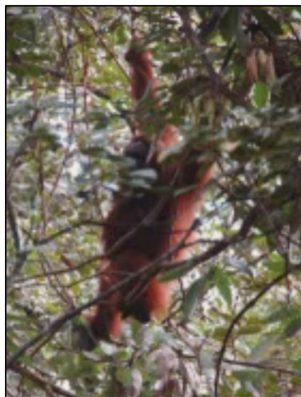
The tour group visited an Orangutan Center to observe this endangered species.