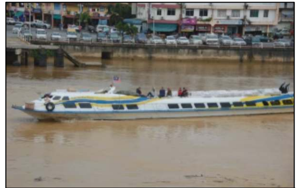
Speedy boat used for longer distance river transportation.