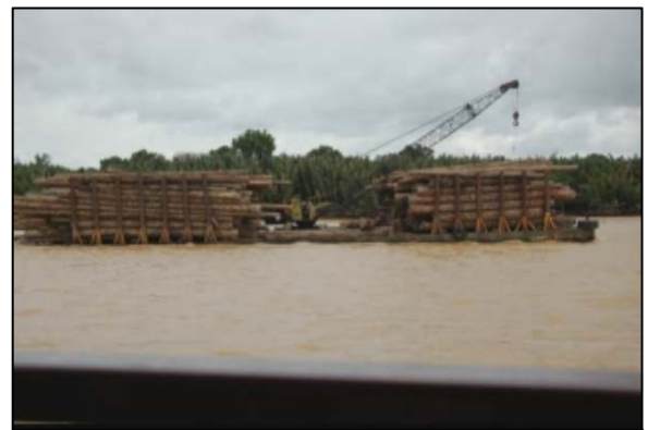
Transporting logs to the saw mills.