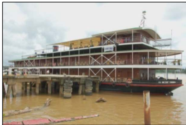
The tour group's four-level riverboat home for 8 days.

While most of us have heard of Borneo, it is an area we know little about, and would be hard pressed to find on a map. Borneo is the third largest island in the world, surpassed in size only by Greenland and New Guinea. It is located north of Australia and south of the Philippines. Borneo is divided into three countries... Brunei, Indonesia and Malaysia.